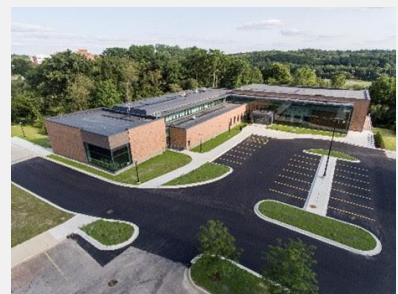
Baker Construction Co.