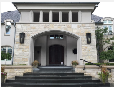
Albaugh Masonry Stone & Tile

The MIM is advancing the masonry industry thanks to our members who bring a wealth of experience and expertise to the organization, and we are honored to work with them to promote the best building system in the world. To recognize our members' contributions to the masonry industry, the MIM will be highlighting different members in the coming months. In this month's issue, we are pleased to shine the light on the following MIM members: