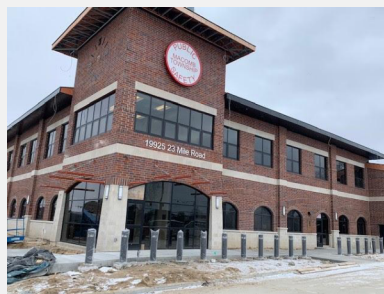
Arisco Contracting Group